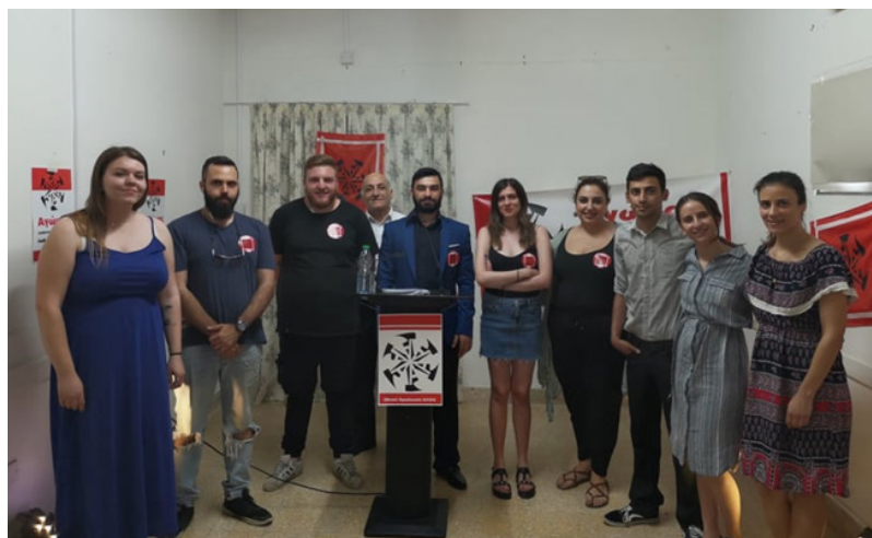
Photo of the facilitators before the pilot game, June 1st 2019